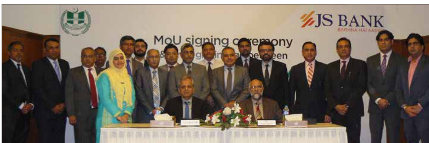
Senior members of JS Bank and Pakistan Institute of Management officials at the strategic linkage signing ceremony.

The learning and organization development division of JS Bank has initiated various projects to enhance its human asset in accordance with the best worldwide practices. The underlying goal is to empower every employee of the JS Bank family by providing them with opportunities to polish their professional and personal skills and contribute towards organizational goals.