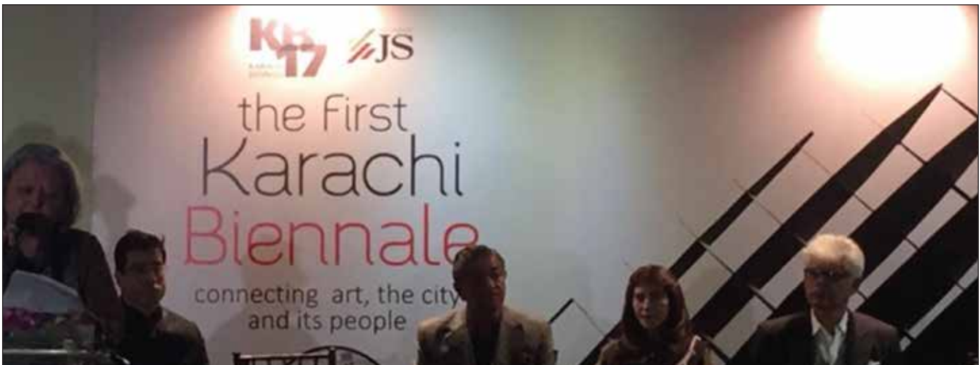
JS Group sponsors first Karachi Biennale 2017

JS Group sponsored Karachi Biennale, 2017. The group's primary objective to support KB is to promote Art from Pakistan, the region and the rest of the world in exhibitions to a wider audience. In this regard, JS Group has also undertaken extensive public outreach program. Regular projects are also planned to penetrate local communities and public spaces until October 2017. JS Group & KB plan to reach 20% of Karachi's population. Both partners are willing to support youth so their minds can be opened to a world of new possibilities as diverse activities have been planned to stimulate students and young professionals with exposure to innovation, new visual knowledge, hands-on training and cultural links through these projects.